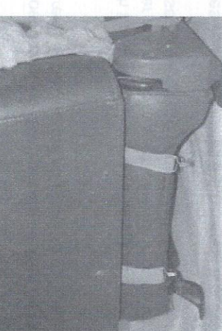
3) Center Straps