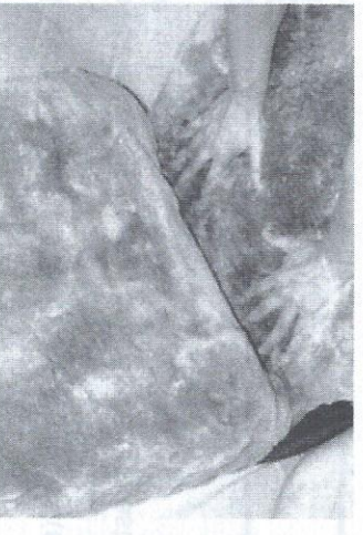
6) Adjust Seat Cover