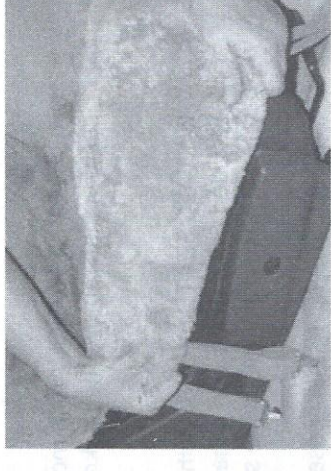
4) Fit Bottom