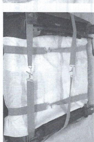
5) Secure Fastening System