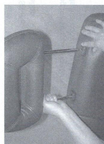
1) Remove Headrest