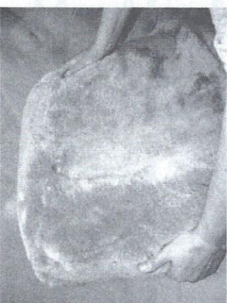
2) Slide on Hood